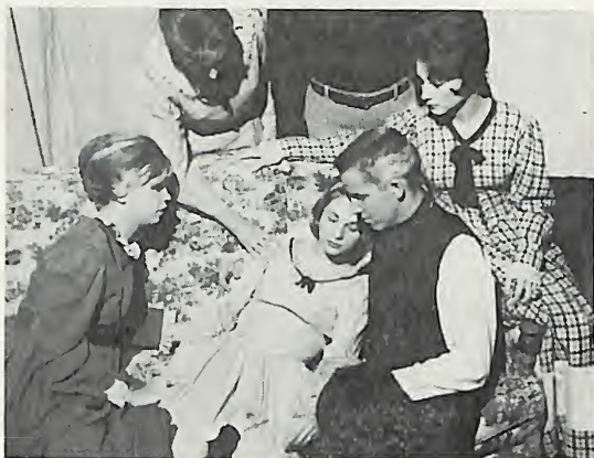
Playcrafters Present 'Little Women'